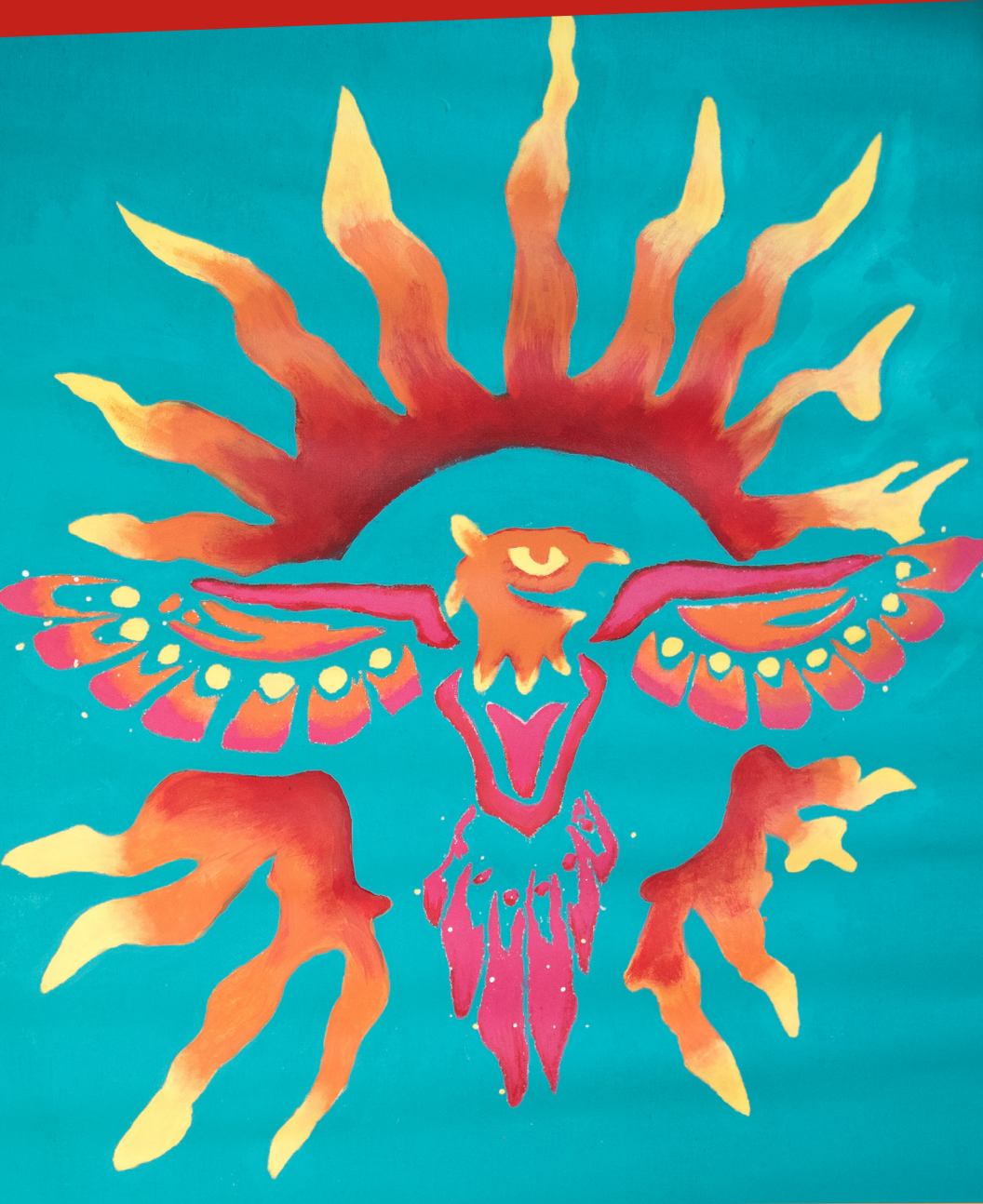
Artwork created by: 10th-12th Grade Students at Prairie Phoenix Academy Art Mentor: Terri Simpson