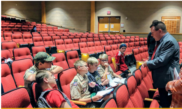
Board Members explaining their role in public service to a group of boy scouts who attended our Annual Meeting.