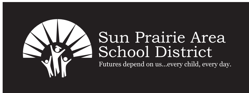
Reverse logo on a dark background