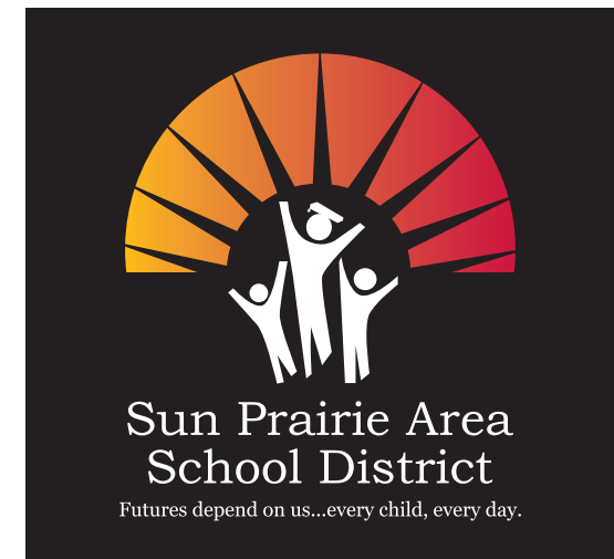
Color logo on a dark background