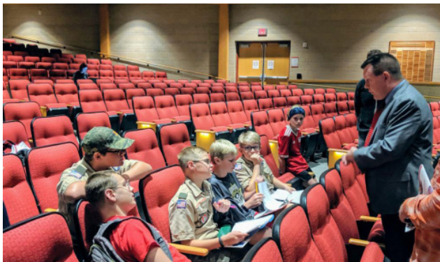
Board Members explaining their role in public service to a group of boy scouts who attended our Annual Meeting.