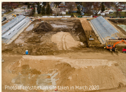
Photo of construction site taken in March 2020

In October 2019, we held a ceremonial groundbreaking for Ashley Field commemorating the final home game played by the Sun Prairie High School football team. Construction on the new multi-purpose stadium began the following week and is scheduled to be completed in time for the fall 2020 sports season.