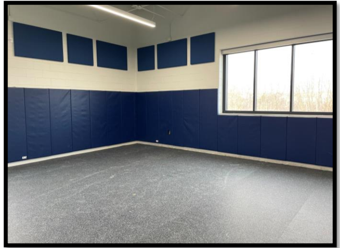
Flooring in the Wrestling and Weight Rooms is nearing completion.