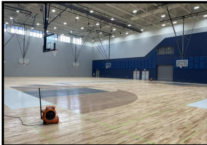
Striping at the Competition Gym is in progress. Shown here is the main basketball & volleyball court.

Athletic and Pool Locker Room flooring is being installed. The resinous flooring – which is used in locker rooms and many restrooms at Sun Prairie West – is durable and easy to clean. Wall Panels are being installed around the second level Walking Track and will be visible from the Main Commons.