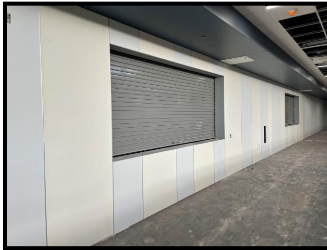
Wall panels are being installed around the second level Walking Track.